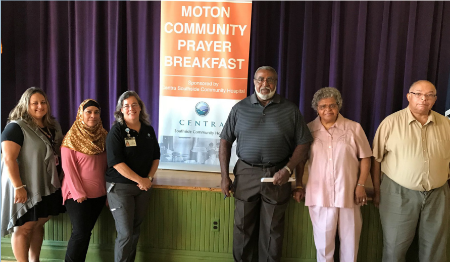
Left, prayer leaders from the September 2018 Moton Community Prayer Breakfast. The Prayer Breakfast is one of Moton's signature community events.