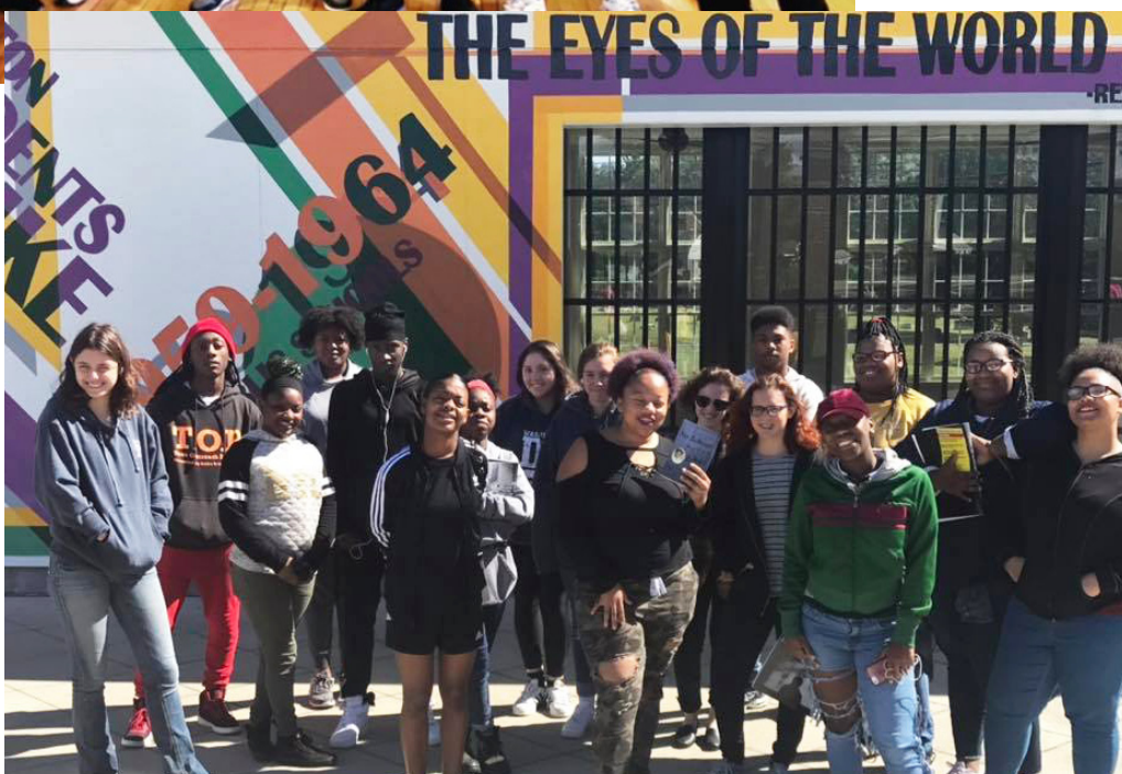
Above left, young leaders finish a tour of the permanent exhibit at Moton.