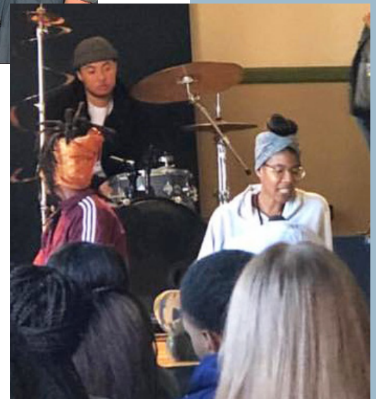
Above, Prince Edward High School Students attend a Virginia Children's Book Festival Program with Author Nic Stone.