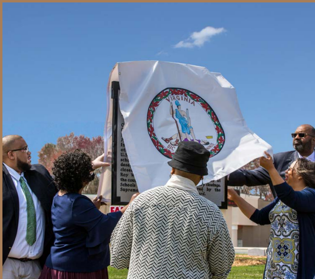
Members of the Moton Museum Staff and Council join with the Oliver White Hill Foundation Board of Directors and the Virginia Department of Historic Resources to unveil the Oliver White Hill Sr. Historical Marker.