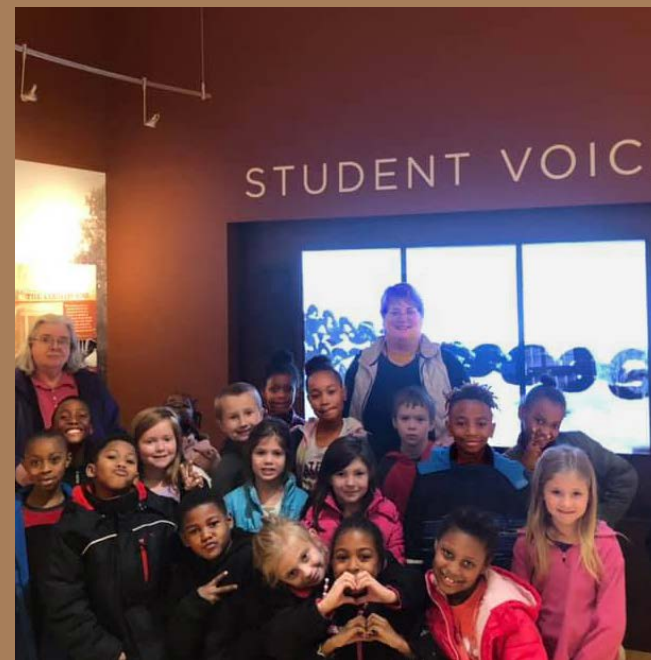
Nottoway County Public Schools