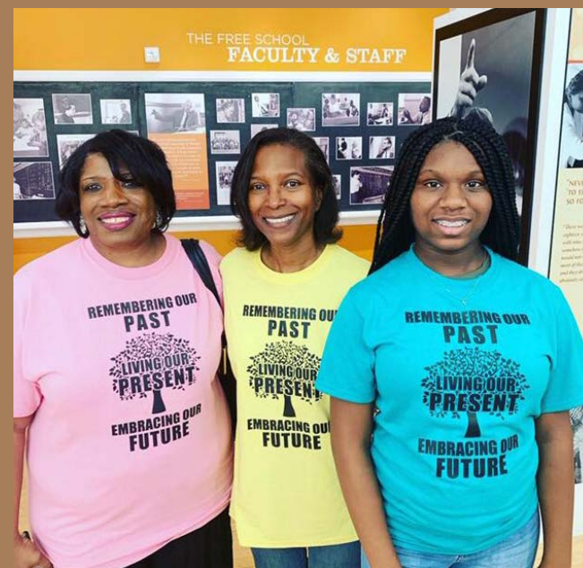
Guests visiting for a Family Reunion Program