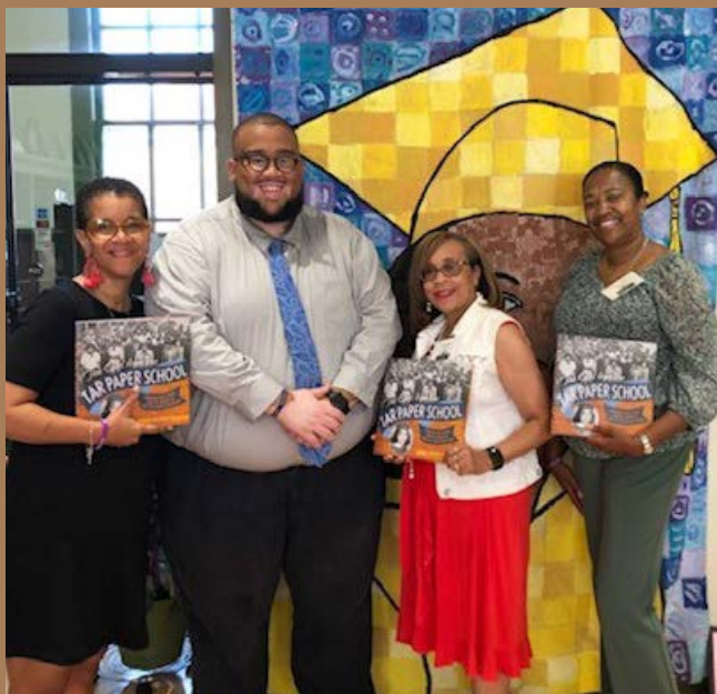
Suffolk County Public School educators visit the Moton Museum after attending the Moton Museum session at the Summer Literacy Institute at Longwood University