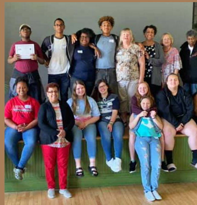
Cumberland County 4-H students visit for a Moton program and workshop

Your presence is most important. The Moton Community Banquet is a night dedicated to recognizing our supporters and honoring our local civil rights history. There are a number of sponsorship opportunities available (souvenir program ad, individual tickets, table/half-table sponsorships, title/community sponsorships).