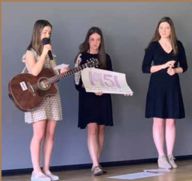
Rockingham County Public Schools visit for their Farmville Tour Guide Program. This program celebrated its 5th anniversary in 2019.