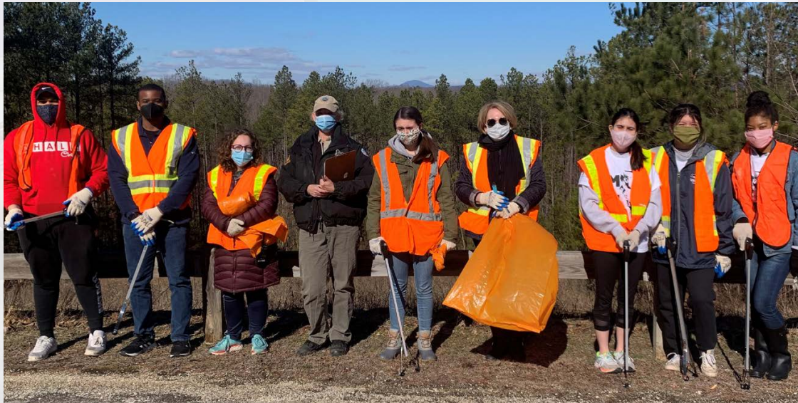
Left, MLK Service Challenge Left bottom, in Petersburg Below, in Topeka, Kansas